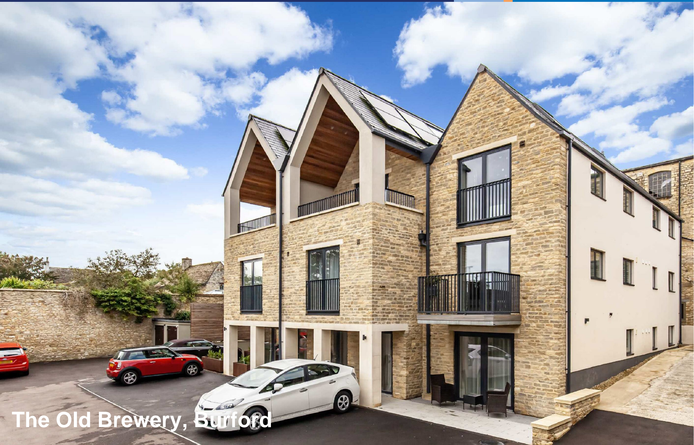
The Old Brewery, Burford